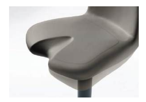
The seat - for more comfort

The dynamic Hugo backrest gives you more flexibility during treatments. The backrest follows your movements and provides support - while you work and when you relax. Your spine is automatically straightened, effectively preventing muscle strain.