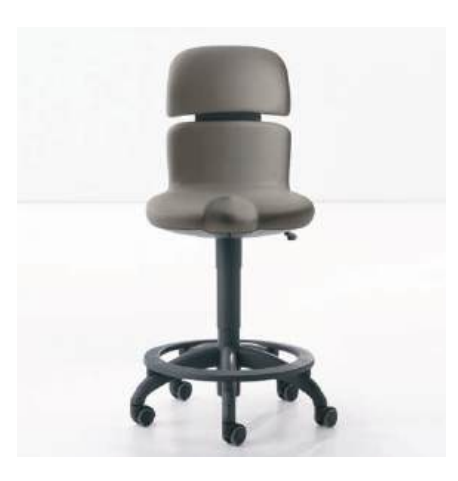
Hugo Manual Plus

Manual height adjustment, with foot ring