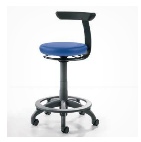
Carl Manual Plus Manual height adjustment, with foot ring