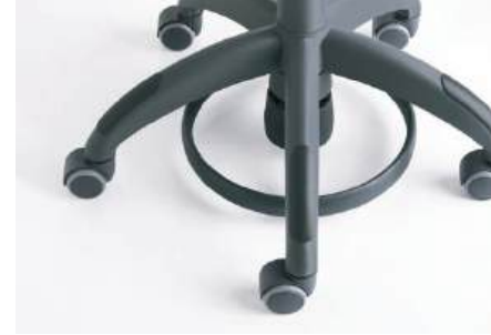
The stool base - for more flexibility

The innovative OptiMotion mechanism with flexible tilt of the front of the left or right half of the seat ensures more freedom of movement and optimal access to the patient. This simultaneously reduces pressure points on the thighs considerably. The thermo upholstery provides increased comfort during prolonged treatment sessions.