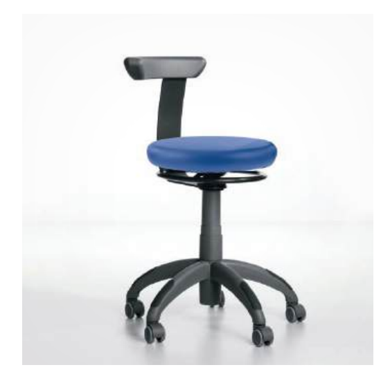
Carl Manual Manual height adjustment